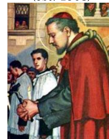
November 4 Patron of Seminarians and Catechists

Oh God, Maintain in your people that spirit with which you inspired your Bishop St. Charles, so that your church may be constantly renewed, conforming itself to Christ and manifesting Christ to the world.